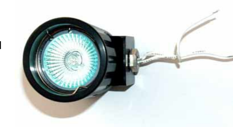
Step 6 You can unscrew and withdraw the hollow bolt now.

Squeeze the ends of the wire clip between your thumb and forefinger and insert the clip in to the bore of the X-Lite body. When the bulb and clip are properly seated, the clip will snap into a groove and securely retain the bulb.